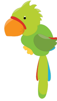
Build: A Parrot