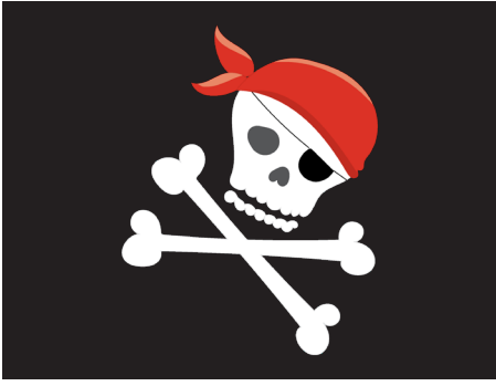
Build: A Pirate Flag