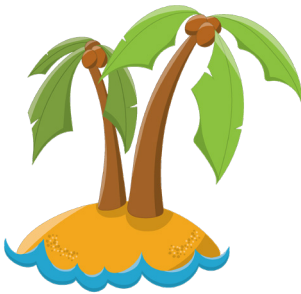
Build: A Palm Tree