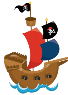
Build: A Pirate Ship